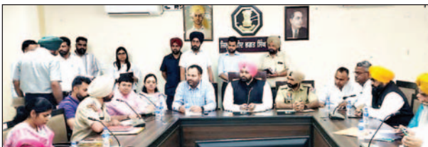
CHETRAM RATTAN SHAHJEED BHAGAT SINGH NAGAR, MAY 7

In wake of aggression at borders, a complete blackout mock drill will be carried out at Nawanshahr city area on Wednesday from 8 pm to 9 pm. The PSPCL will cut the power supply before 8:00 pm and resume the same after an hour.