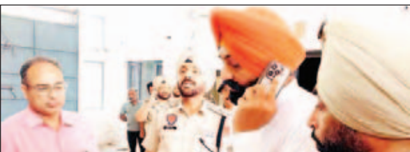
CHANDIGARH, MAY 16

Chief Minister S. Bhagwant Singh Mann-led Punjab Government has taken a significant step to install Artificial Intelligence (AI)-based ultra-modern cameras in Punjab's jails to further strengthen security systems. This initiative will enable 24x7 surveillance of various activities including illegal drug use and mobile phone usage in the state's jails. Punjab Jail Minister S. Laljit Singh Bhullar today conducted surprise inspections of the Central Jails in Rupnagar and Kapurthala. He said