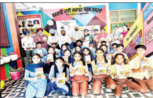
VERMA GURDASPUR, MAY 16