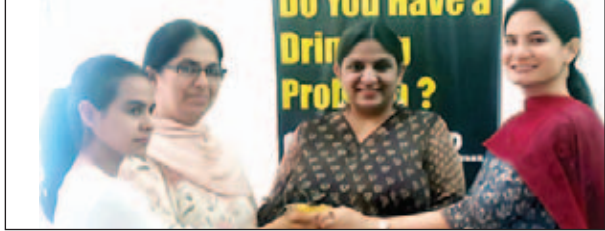
CHANDIGARH, MAY 21

helped improve their vocabulary, social skills, and sensory awareness. This activity not only fostered awareness about healthy eating habits but also enhanced the children's creativity and motor skills. The cheerful faces of the children and the bright mango-themed atmosphere reflected the success of the event. Overall, the Mango Activity was a perfect blend of fun, food,