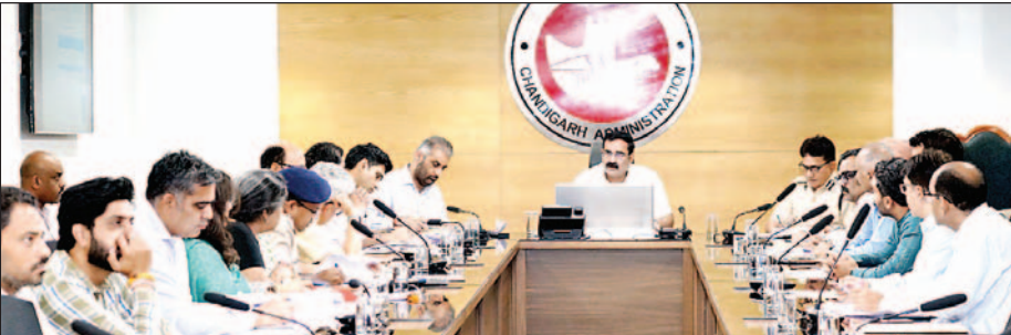
CHANDIGARH, MAY 21

This initiative, supported through the Hon'ble Governor's Discretionary Grant for FY 2024-25, aims to motivate academic excellence and alleviate financial barriers in students' educational journeys.