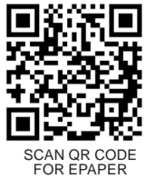
SCAN QR CODE FOR EPAPER