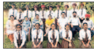
the school and the parents. On this occasion, the school principal Mrs.