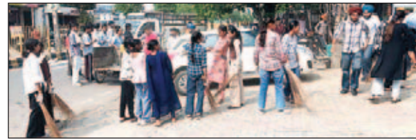
stated that this drive was initiated in accordance with instructions of Higher Education. Drive will continue in future. Principal stated that college has established many milestones in field of NSS.