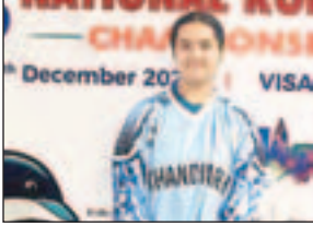
line hockey goalkeeper, winning the gold medal at