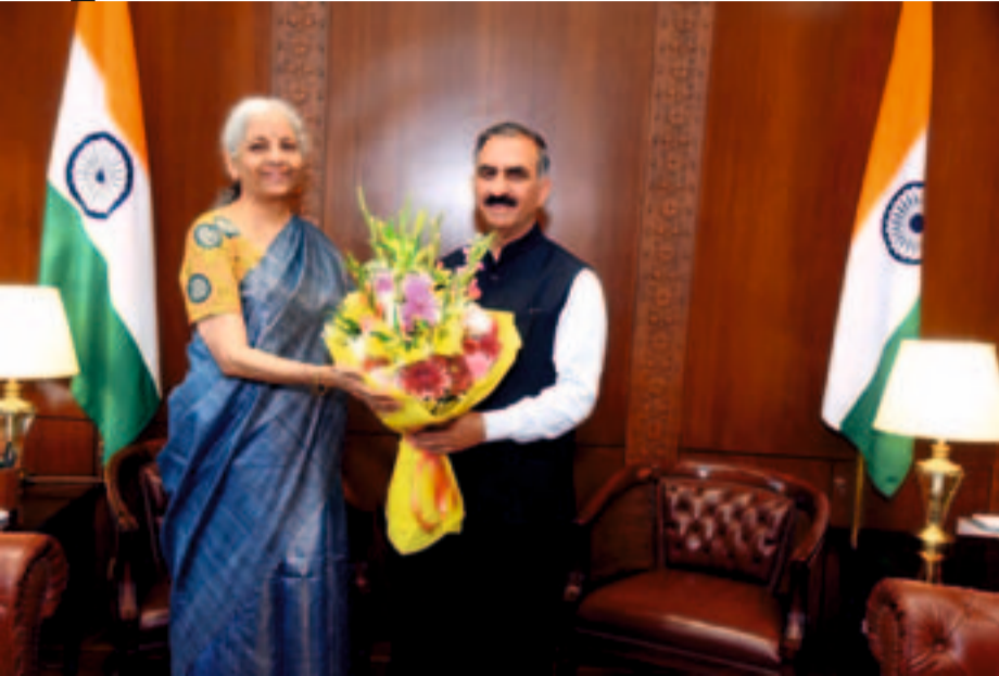
NEW DELHI: Chief Minister Thakur Sukhvinder Singh Sukhu called on Union Finance Minister Nirmala

Sitharaman at New Delhi today and sought a financial package under special central assistance to cover the