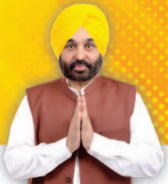
S. Bhagwant Singh Mann Chief Minister, Punjab

Department of Information and Public Relations, Punjab