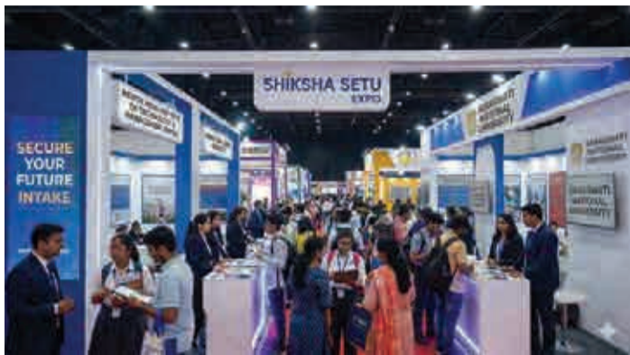
Scheduled to take place from 21-23 May 2026 at the Parade Ground, Sector 17, this focused education fair in Chandigarh promises to bring leading universities, colleges, international institutions, and skill providers under one roof. Organised by Vaarta Trade Fairs India Pvt. Ltd., the exhibition is strategically positioned to serve the robust higher education belt comprising Punjab, Haryana, Himachal Pradesh, and the tricity area. A Shift from Footfall to Focus Unlike traditional education fairs that prioritize sheer crowd volume, Shiksha Setu Expo distinguishes itself through a result-oriented framework. The platform is meticulously designed to facilitate meaningful, direct interactions between institutional representatives and admission-ready students. By prioritizing qualified enquiries, the expo creates a transparent environment where families can effectively compare course offerings, explore global study pathways, and make informed, confident decisions. Comprehensive Opportunities Under One Roof The expo caters to a wide spectrum of educational needs, offering: Diverse Academic Programs: Direct exploration of UG, PG, diploma, and specialized certification programs. Global & Domestic Reach: Participation from premier Indian universities, private colleges, international institutions, and study abroad consultants. Skill & Tech Integration: Presence of vocational institutes,

BUREAU CHANDIGARH: As the landscape of higher education expands at an unprecedented rate, students and parents are increasingly overwhelmed by a maze of domestic and international choices. To cut through the noise and provide a credible, structured pathway to the right admission, the region is gearing up for the highly anticipated Shiksha Setu Expo 2026.