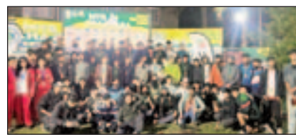
in the competition, reflecting the growing popularity of mountain biking in India. The

SUBHASH MAHAJAN CHAMBA: The first edition of MTB Chamba 2026 concluded successfully, marking a significant step towards promoting adventure tourism in Himachal Pradesh. The event was organized by the Chamba Cycling Association with support from Himachal Tourism under the "Chalo Chamba" initiative. Cyclists from 10 states and 16 cities across the country participated