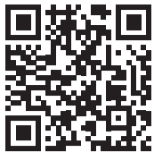
SCAN QR CODE FOR EPAPER