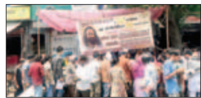
countries. Prime Minister Narendra Modi also visited the International Ashram in